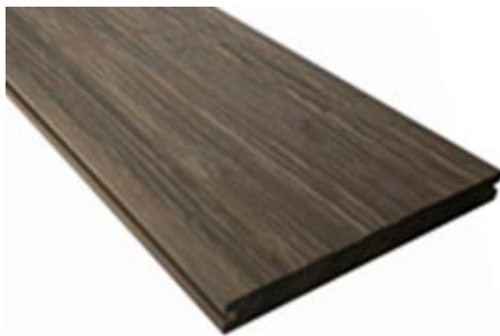
US54 (Coastal) Grooved solid Deck Board 210mm x 23mm

Solid (Coastal) deck joist span is 400mm max.